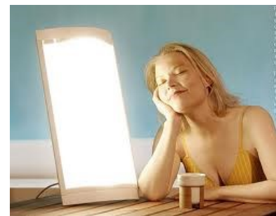
Light Therapy helps beat the Winter Blues