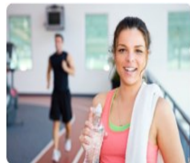
Consistent exercise boosts your mood

"During massage, levels of the stress hormone cortisol... fall while levels of the neurotransmitter serotonin... rise"